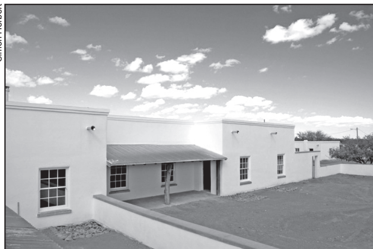
Pima County Historic Preservation Bonds. Canoa Ranch: Rehabilitated blacksmith shop, tack room, and salt storage building.

Next General Meeting: July 19, 2010 < www.az-arch-and-hist.org >