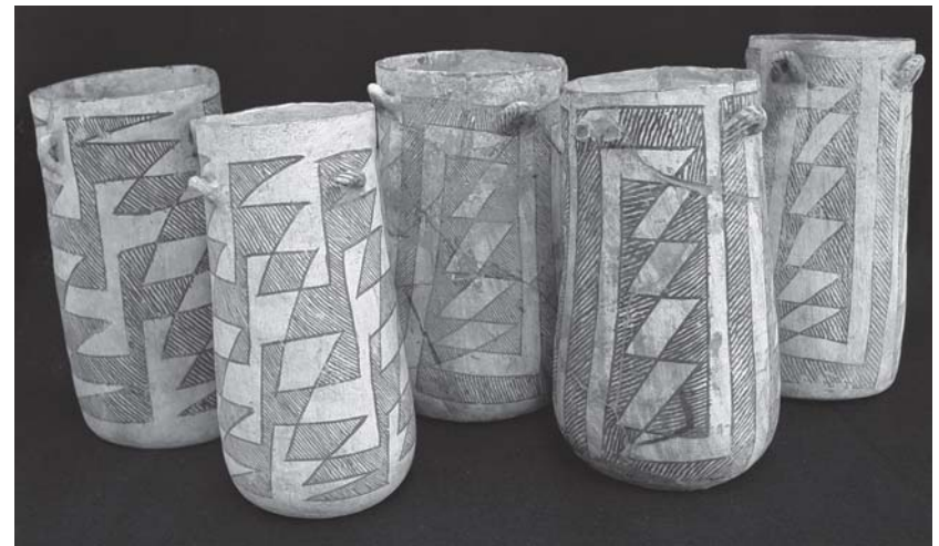
Cylinder jars from Room 28 at Pueblo Bonito in Chaco Canyon, probably used in ritual consumption of chocolate beverages in the late eleventh century. Vessels in the collection of the American Museum of Natural History.

Next General Meeting: March 21, 2011 www.az-arch-and-hist.org