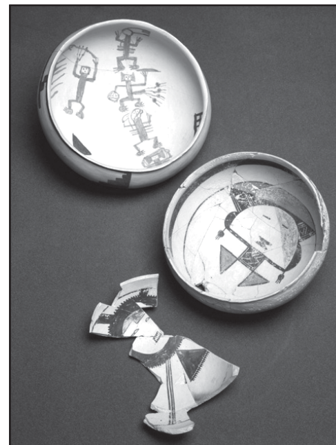
Ancestral Hopi Painted Pottery Seminar Friday, May 20

Next General Meeting: May 16, 2011 7:30 p.m., Duval Auditorium, University Medical Center www.az-arch-and-hist.org